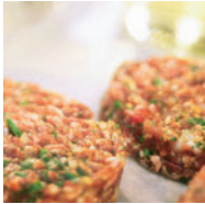
Ceylamix Formulations for manufacturing meat products.