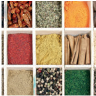
Ceylan Spices and natural, whole, crushed and hygienized herbs.